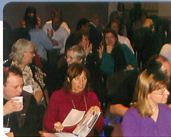
Full house at the UPCON symposium