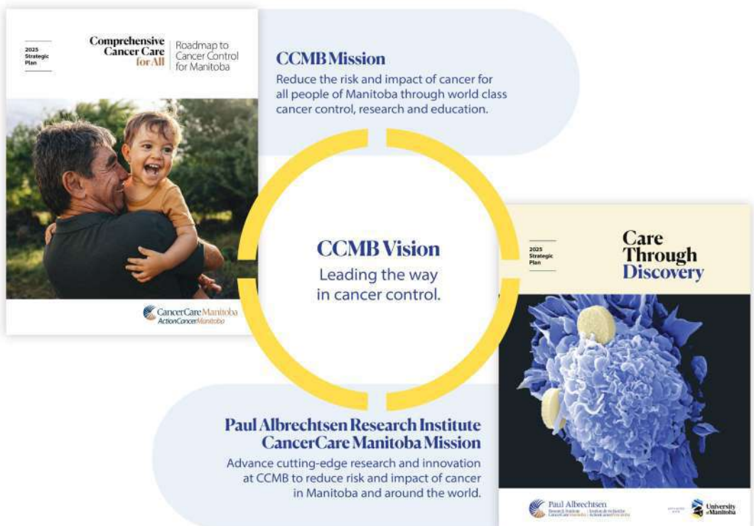
The Research Institute shares a common Vision with CCMB, demonstrating synergistic efforts toward reducing the risk and impact of cancer for all.