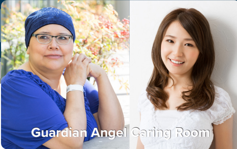
Guardian Angel Caring Room

For more information visit www.cancercare.mb.ca