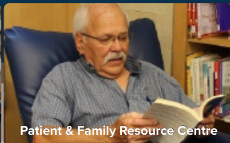
Patient & Family Resource Centre