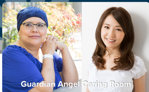
Guardian Angel Caring Room

For more information visit www.cancercare.mb.ca