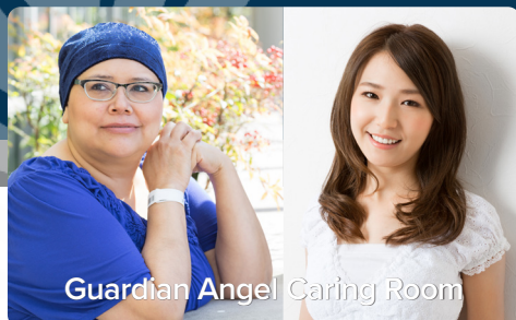
Guardian Angel Caring Room

For more information visit www.cancercare.mb.ca